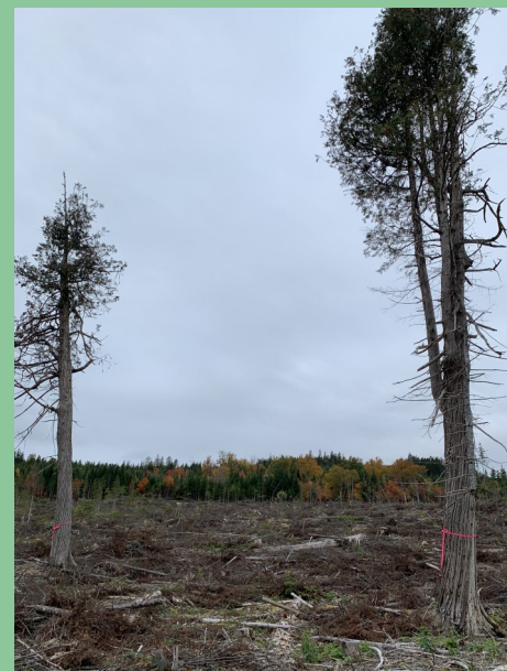
Examples of in-block clumped and dispersed retention which provide habitat for various ungulate and bird species.