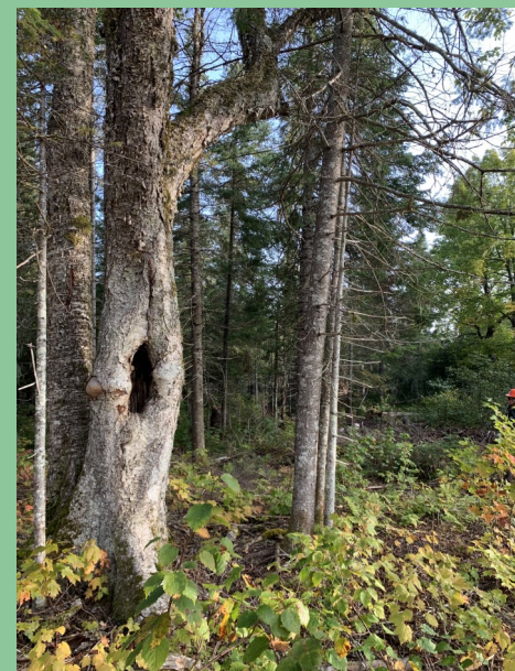
Numerous examples of cavity trees were observed during field inspections.