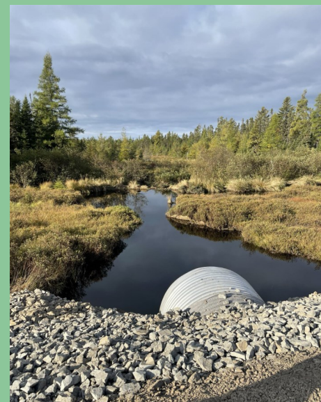
Example of a culvert that was well installed and maintained to ensure the free flow of water.